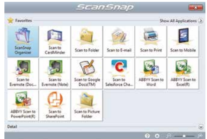
*Quick Menu for Mac OS features other applications