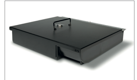
Safescan 4141L Lockable lid Art. no: 132-0432