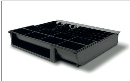
Safescan 4141T2 Cash drawer tray 6/8 Art. no: 132-0431