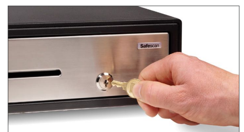
With 3-position lock (locked, stand-by and open)