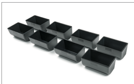
Safescan 4141CC Coin Cups Art. no: 132-0497