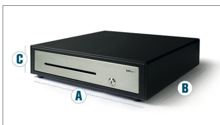
Dimensions: A: 41 cm - B: 41.5 cm - C: 11.5 cm