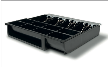
Safescan 4141T1 Cash drawer tray 4/8 Art. no: 132-0430