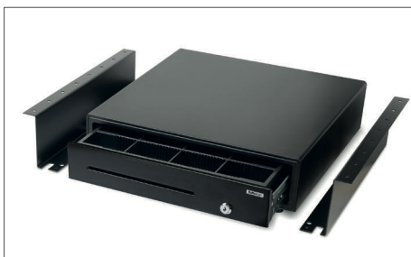
Safescan 4141B Mounting Bracket Art. no: 132-0436