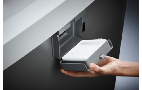
Dahle Office 414air document shredder