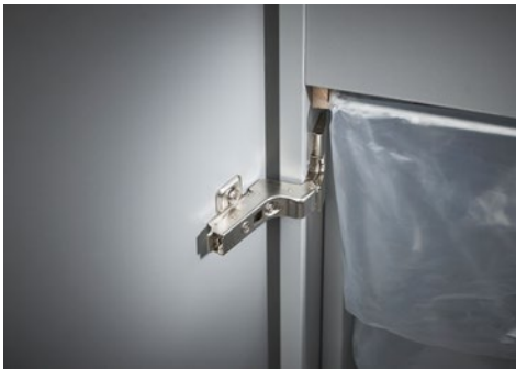
Dahle Office 414air document shredder