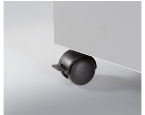
Practical swivel casters for flexible use