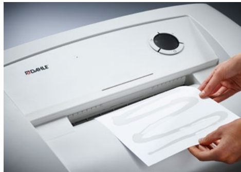
Dahle Office 414air document shredder