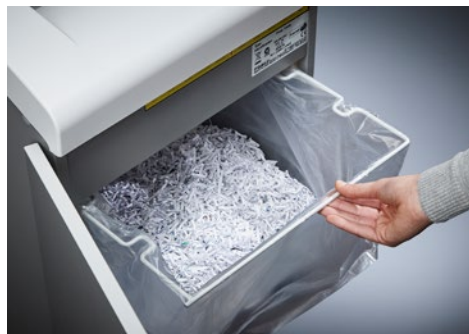
Dahle Office 414air document shredder