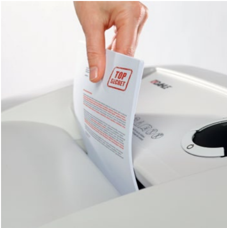
Innovative MHP technology® shreds up to 30 % more paper