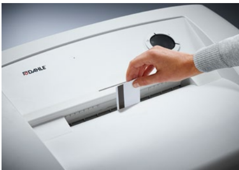
Dahle Office 414air document shredder