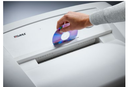
Dahle Office 414air document shredder