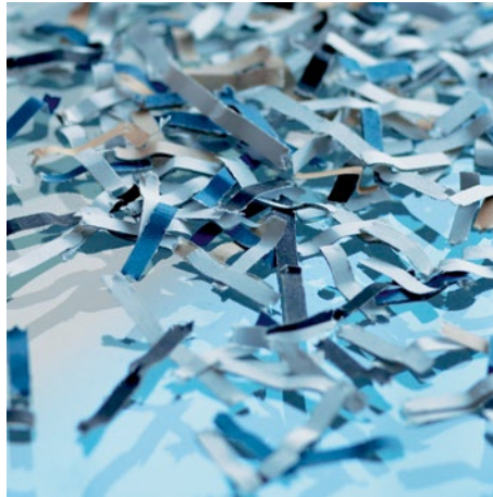
P-4 security: recommended, for example, for data media containing particularly sensitive, confidential and personal data