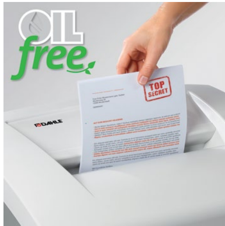
Shredding the convenient way, all without the time-consuming process of oiling the cutters