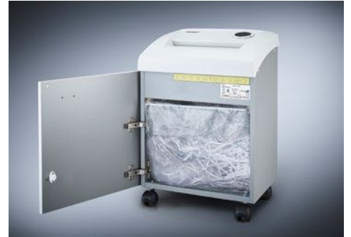
Dahle Waste 203 document shredder