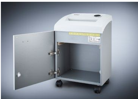
Dahle Waste 203 document shredder