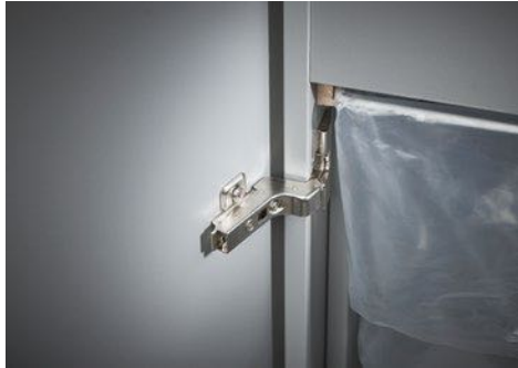
Dahle Waste 206 document shredder