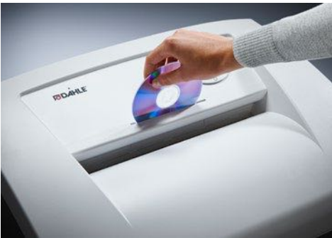
Dahle Waste 206 document shredder