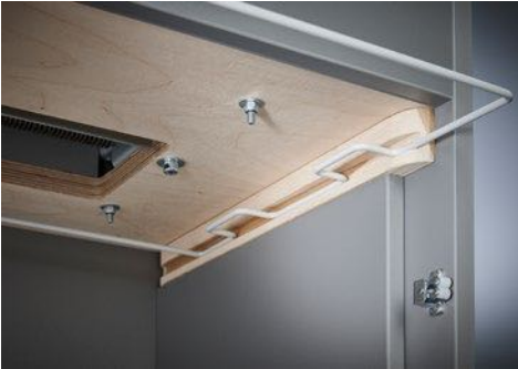
Dahle Waste 206 document shredder