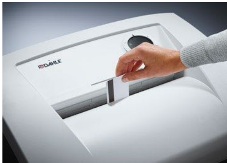
Dahle Waste 206 document shredder