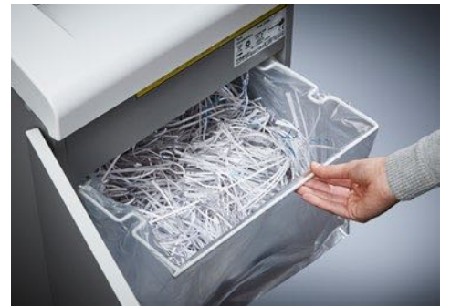
Dahle Waste 206 document shredder