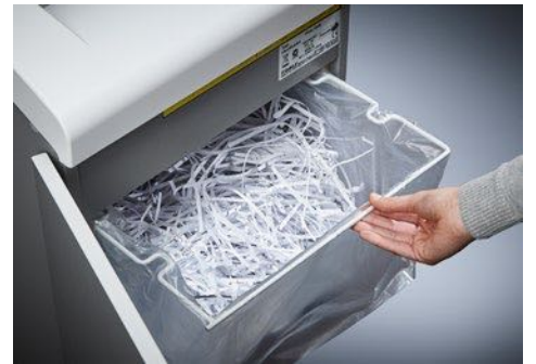
Dahle Waste 110 document shredder