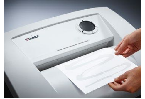
Dahle Waste 110 document shredder