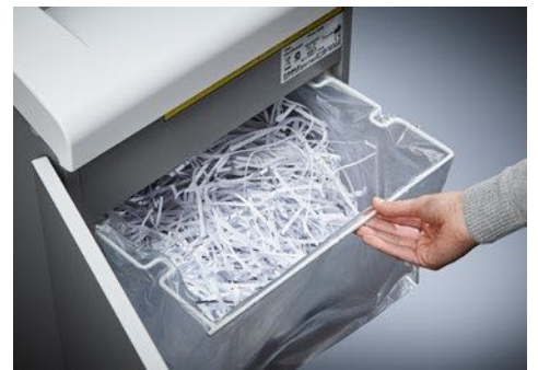
Dahle Waste 114 document shredder