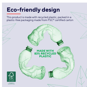
PRODUCT PICTORIAL 2