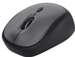
PRODUCT VISUAL 1