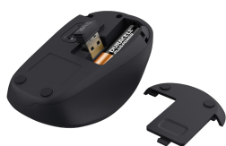
PRODUCT BOTTOM 1