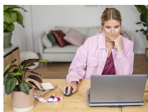
LIFESTYLE VISUAL 1