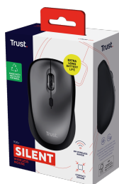
PACKAGE VISUAL 1