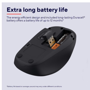
PRODUCT PICTORIAL 4