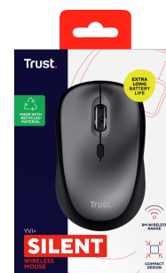
PACKAGE FRONT 1