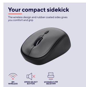
PRODUCT PICTORIAL 3