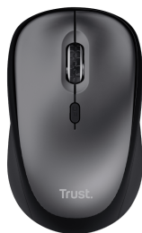
PRODUCT TOP 1