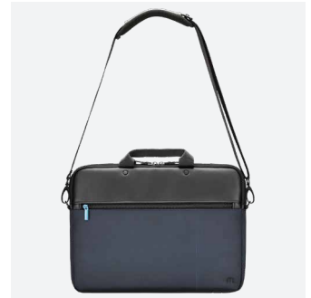
Adjustable and removable shoulder strap