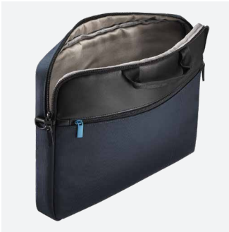
1 reinforced compartment