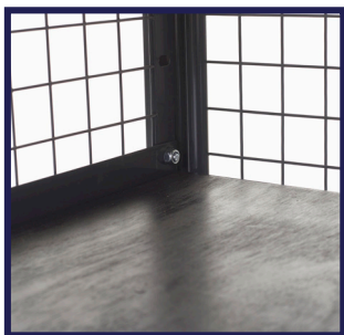
Holes to adjust shelves