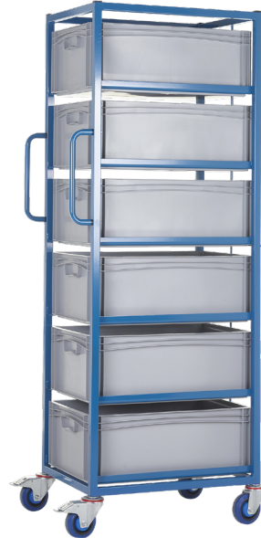
Complete with 6 x 220mm Containers