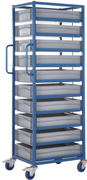
Complete with 10 x 120mm Containers