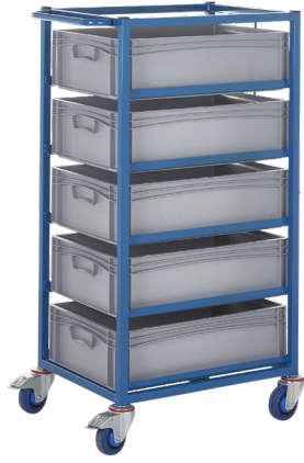
Complete with 5 x 170mm Containers