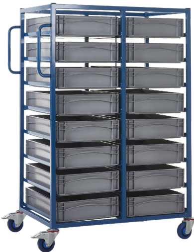
Complete with 16 x 120mm Containers