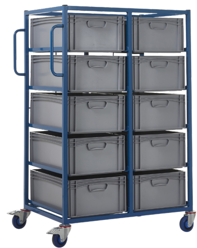
Complete with 10 x 220mm Containers