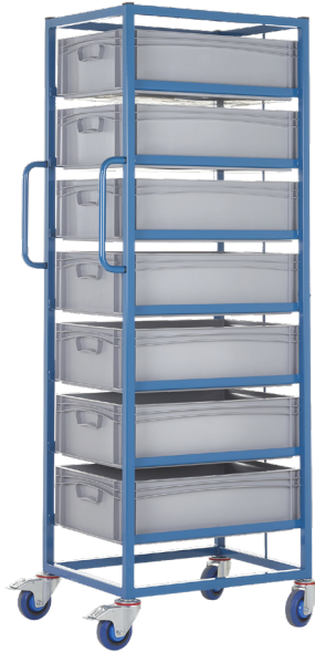
Complete with 7 x 170mm Containers