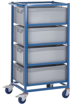
Complete with 4 x 220mm Containers