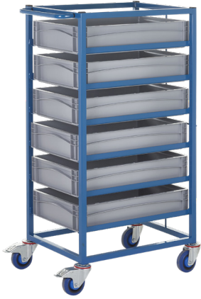
Complete with 6 x 120mm Containers