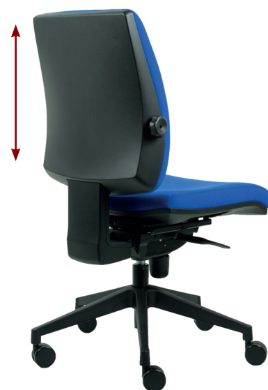
Height adjustment of the back