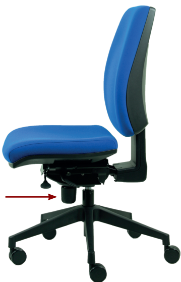
Tension adjustment of back and seat inclination

TEKNIK OFFICE LTD SALES & SERVICE: Phone: + 1234 328804 Fax: + 1234 342446 Mail: service@teknikoffice.co.uk