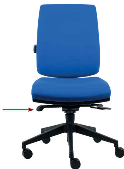
Height adjustment of the seat