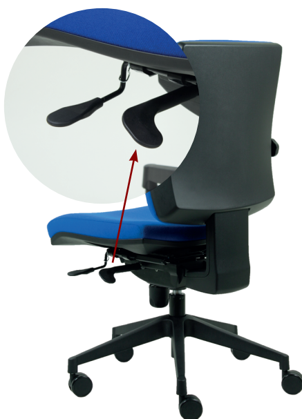
Reclining of the back / the seat