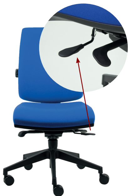
Adjustable sliding seat