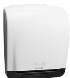
90045 Katrin Plastic Dispenser For System Paper Towel Roll, White