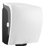
82094 Katrin Plastic Dispenser For System Paper Towel Roll, White