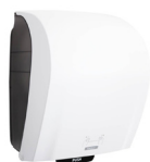
40735 Katrin Plastic Dispenser Extra Large For System Paper Towel Roll, White