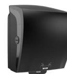
82070 Katrin Plastic Dispenser For System Paper Towel Roll, Black