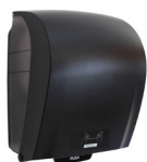
40711 Katrin Plastic Dispenser Extra Large For System Paper Towel Roll, Black

Selection from all countries. Please refer to web page for market-specific availability.