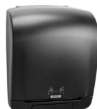
92025 Katrin Plastic Dispenser For System Paper Towel Roll, Black