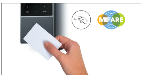
Clocking with MIFARE, RFID proximity card or PIN code