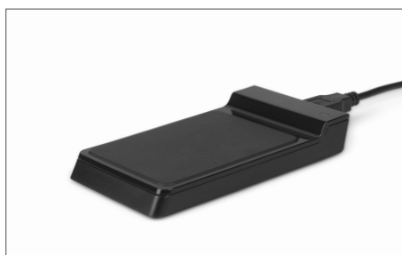
TimeMoto RF-150 USB RFID Reader Art. no: 125-0605