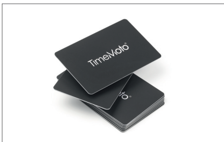
TimeMoto RF-100 set of 25 RFID badges Art. no: 125-0603