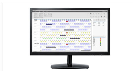
TimeMoto desktop software for single PC use included