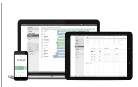
TimeMoto Cloud / TimeMoto Cloud Plus Art.no: 139-0590 / 139-0591