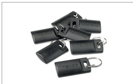
TimeMoto RF-110 set of 25 RFID key fobs Art.no: 125-0604