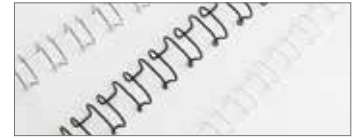
Binding Wires, 21 Loop