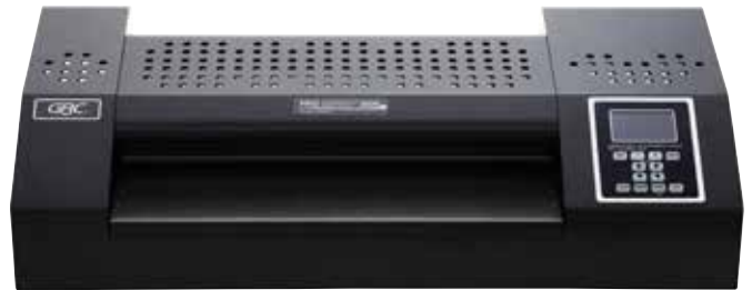
Pro Series 3600