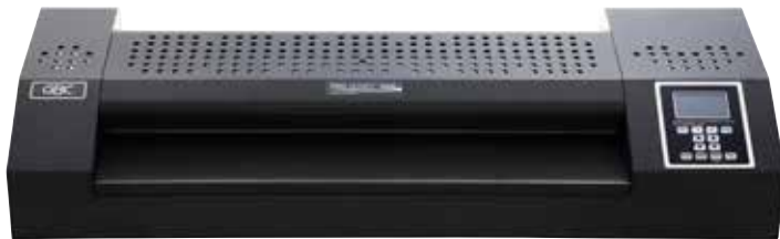
Pro Series 4600