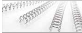
Binding Wires, 34 Loop