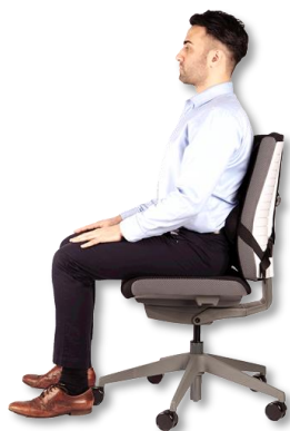
Ergonomic design Full back support to prevent back tension