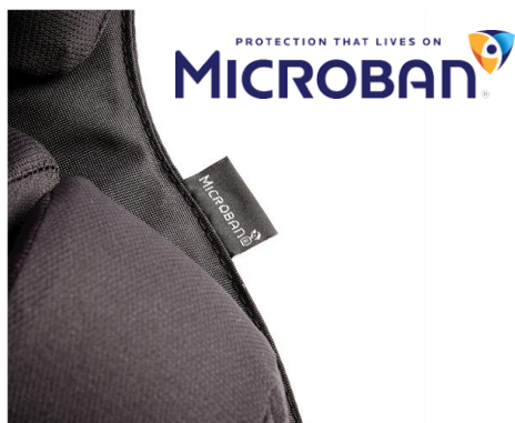
Microban® Protection Built-in Microban protection fights the growth of harmful bacteria for the product's lifetime.