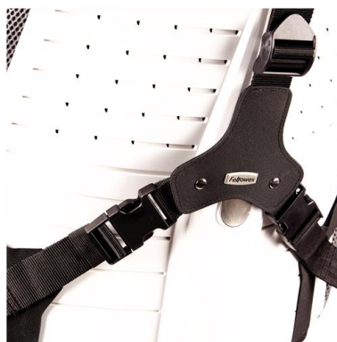
Tri-Tachment™ Innovative Tri-Tachment™ ensures stability, eliminating constant readjustment