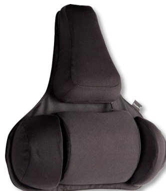
Unique design 3 Section lumbar support expands and contracts to natural body curvature.